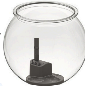
Side view of the base (sump)

Place the base (sump portion) of the filter on the bottom of the tank and position it towards the back of the tank.