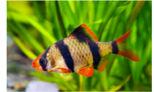
Tiger Barbs are ideal beginner fish but can be fin nippers

So you just set up your new aquarium and are getting ready to purchase fish. It is always best to do a little research before going to your aquarium store. There are many types of fish to choose from such as tropical versus coldwater, territorial or community, aggressive or peaceful? Here are some questions you should ask to help ensure you have made the right choice in selecting your new pets.