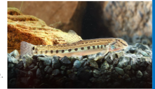
Weather Loaches can grow to 20 inches

When it comes to choosing a fish that is territorial, like some of the barbs, it is best to provide ornaments and other decorations so they can hide and rest from others while being able to establish their own territorial boundaries. Territorial fish do not often tolerate others of their own species, so it is best to just buy one.