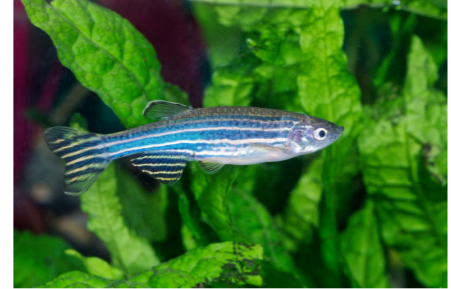
Active Community Fish