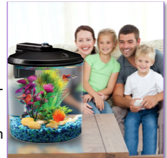
An Aquarium Provides Family Enjoyment

Children who are raised with pets at home show a much higher empathy level than kids who are raised without pets. Fish ownership teaches children responsibility too and can be given age-appropriate care tasks. They can also help when it comes time to handle maintenance chores or feeding time (always be sure to provide adult supervision).