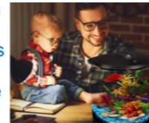
Teach your children well

Pets in the Classroom is an educational grant program that provides financial support to teachers to purchase and maintain pets in their classroom. The program was established by the Pet Care Trust to provide children with an opportunity to interact with pets, an experience that can help to shape their lives for years to come.