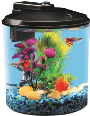
Aquarium Kit Model AP360-15FFP

Children under the age of 13 should be supervised by an adult with the setup, maintenance and fish care