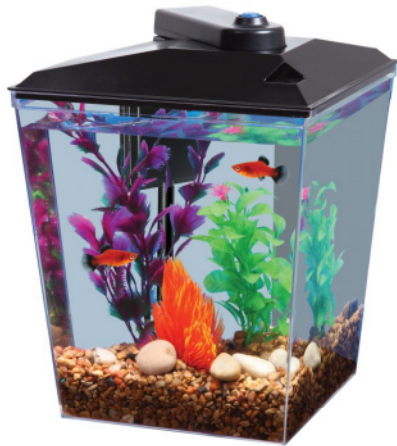
Aquarium Kit Model: AP11104FFP

Children under the age of 13 should be supervised by an adult with the setup, maintenance and fish care