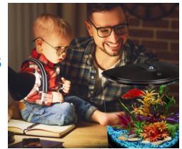
Teach your children well

Pets in the Classroom is an educational grant program that provides financial support to teachers to purchase and maintain pets in their classroom. The program was established by the Pet Care Trust to provide children with an opportunity to interact with pets, an experience that can help to shape their lives for years to come.