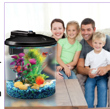
An Aquarium Provides Family Enjoyment

Children who are raised with pets at home show a much higher empathy level than kids who are raised without pets. Fish ownership teaches children responsibility too and can be given age-appropriate care tasks. They can also help when it comes time to handle maintenance chores or feeding time (always be sure to provide adult supervision).