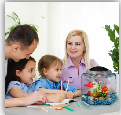
Aquariums are Ideal for Families

We have refreshed our website, new layout and easier to navigate. Check out which fish are the best to keep if you are a beginner. Remedies to issues or problems you may be encountering in your fish tank. Plus videos on setting up your new aquarium, step-by-step guidance. Helpful information on how to successfully keep fish.