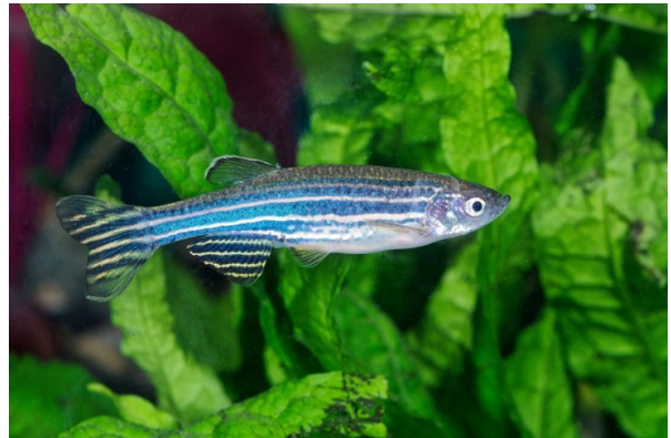
Active Community Fish